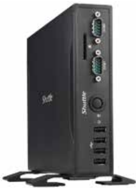
Example of a small form factor computer. Model shown: Shuttle DS57U